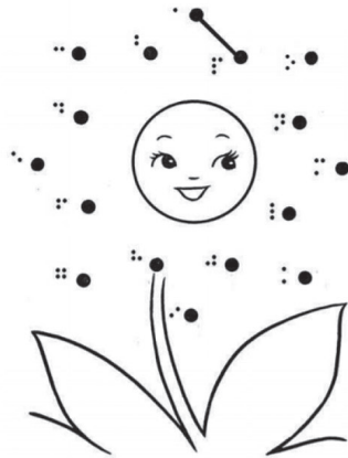
Figure 2: Connect the dots