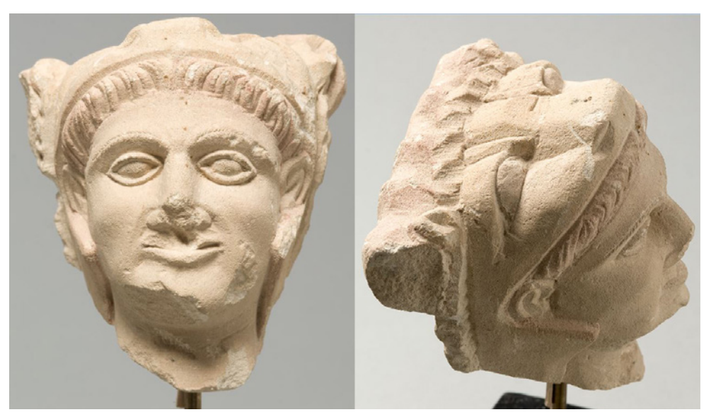
Fig. 4. Head of an early Hellenistic Heracles-Melqart from Kition-Bamboula, Medelhavsmuseet