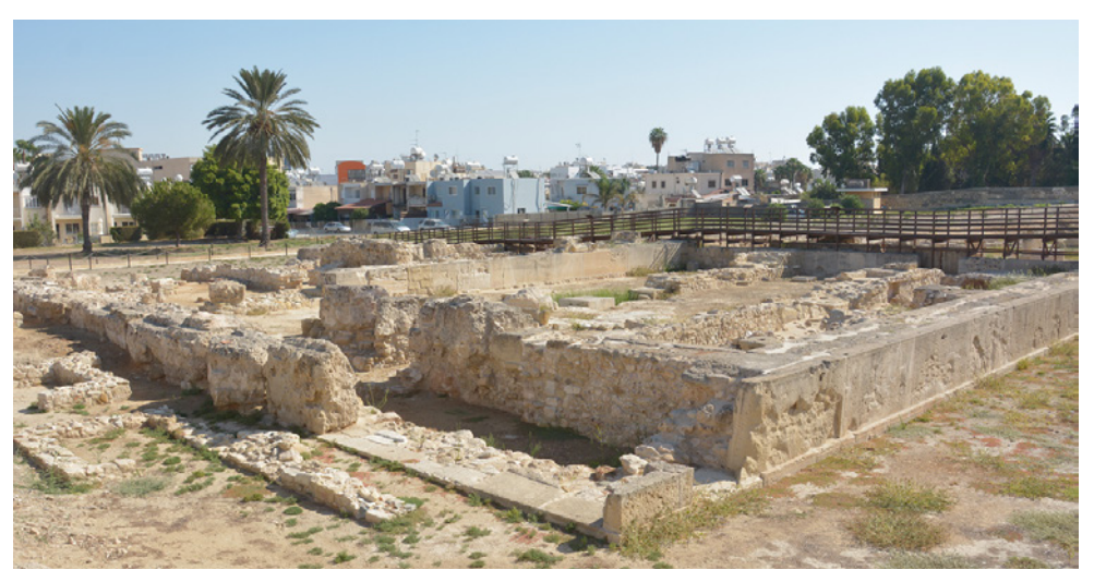
Fig. 3. Temple of Astarte, Kition-Kathari area, photo by K. Zeman-Wiśniewska

of Ya" (Cyprus).<sup>22</sup> The other is the prism-inscription of Esarhaddon, dated to 673/2 BC, which mentions twenty-two places and names of their kings, ten of which are connected with Cyprus. Kition can be identified as Carthage, ruled by king Damusi.<sup>23</sup> It was so at least in the 5<sup>th</sup> cent. BC, when local kings started calling themselves rulers of Kition, and they were among the first rulers to issue a coin in Cyprus. Moreover, thanks to the coinage we have a complete list of Kitian kings from ca. 480 till 312 BC, and they all bear Phoenician names:<sup>24</sup> Baalmelek (480-450 BC), Azbaal (450-425 BC), Baalmelek II (425-400 BC), Baalrom (400-394 BC), Melikiathon (394-361 BC), Pumation (361-312 BC).