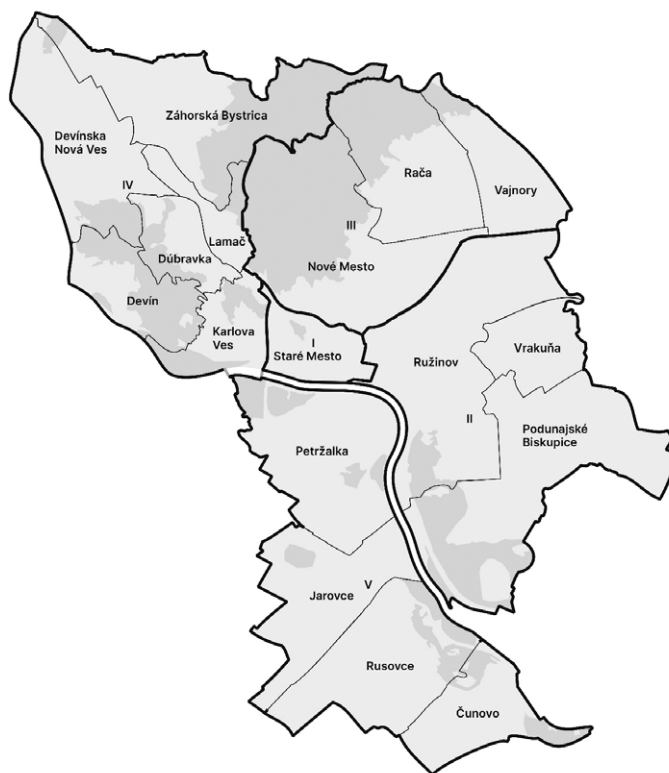
Figure 2. Bratislava – city districts overview