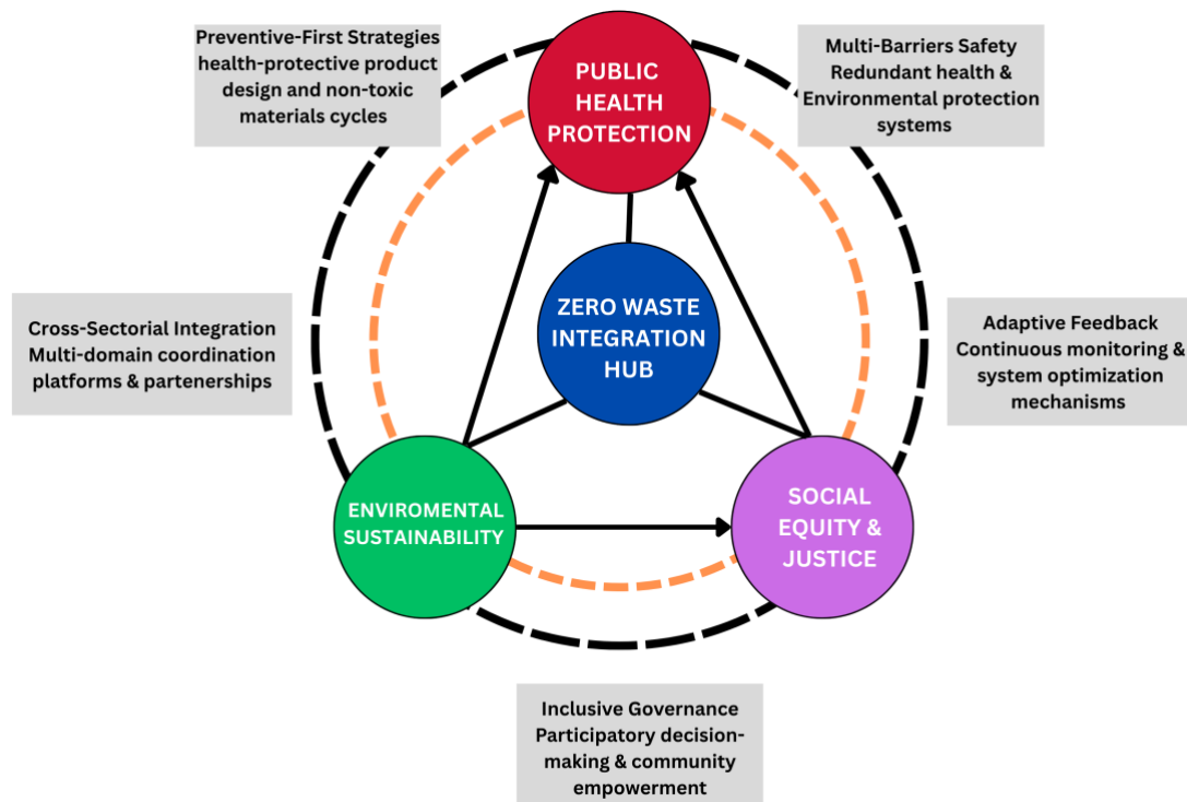
Figure 2. An Integrated Theoretical Framework for Health-Centred Zero Waste Systems.

The framework conceptualizes domain relationships between public health protection, environmental sustainability, and social equity as interconnected domains with bidirectional feedback relationships rather than separate spheres (Maalouf et al. 2025). Public health considerations inform environmental interventions through exposure pathway analysis and risk assessment, while environmental protection strategies influence health outcomes through ecosystem service provision and pollution reduction. Social equity dimensions shape both health and environmental outcomes through their effects on exposure patterns, access to resources, and participation in decision-making processes.