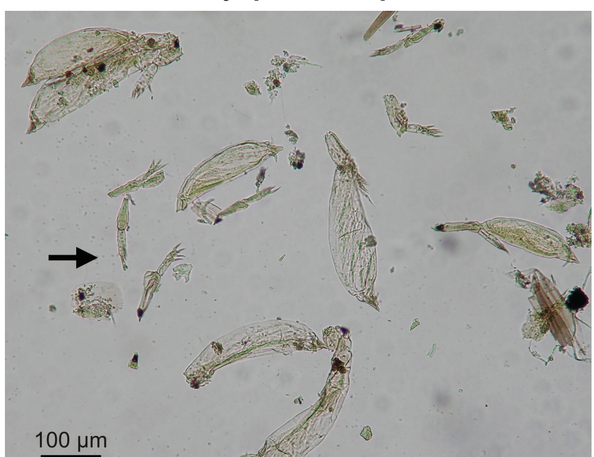
Fig. 1. Hesperomyces virescens thalli removed from the elytron of Harmonia axyridis from Divna. The arrow shows a group of thalli without perithecia.

The distribution of H. axyridis in Croatia, based on the records reported by Mičetić Stanković et al. (2011), Ivezić et al. (2011) and this paper, is shown in Fig. 2. Our records from Pelješac Peninsula are about 85-90 km SE of the town Sinj, the southernmost place in Croatia so far reported as a locality of H. axyridis (Mičetić Stanković et al. 2011).