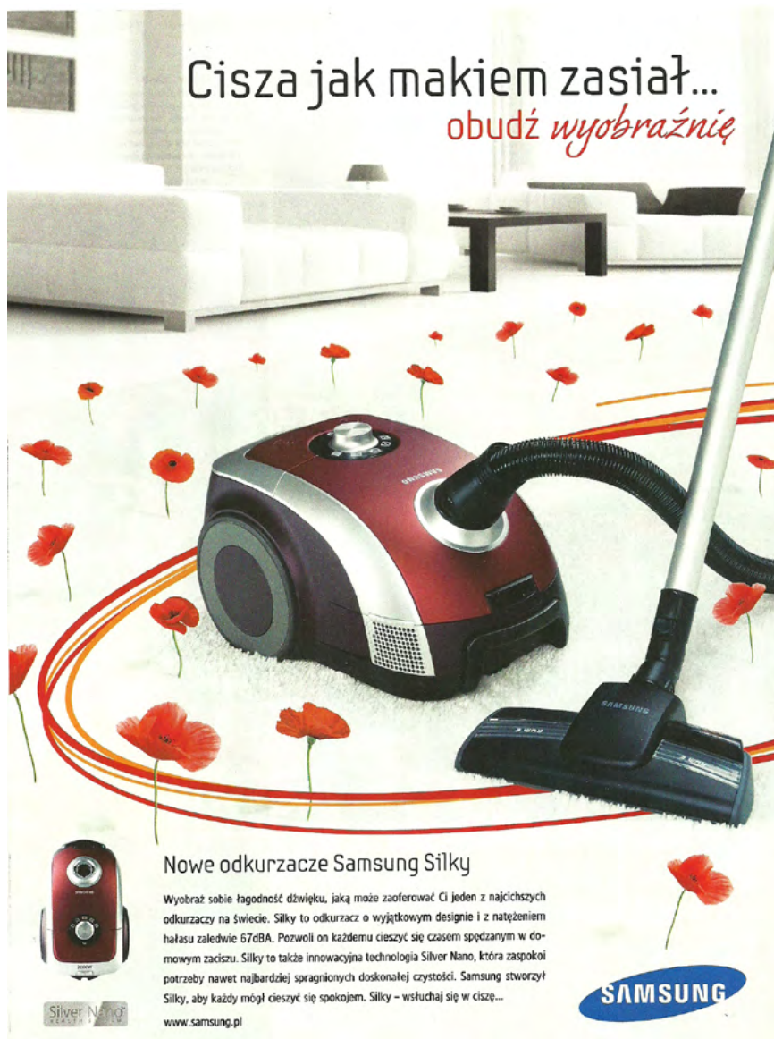
11. Samsung Silky vacuum cleaner advertisement