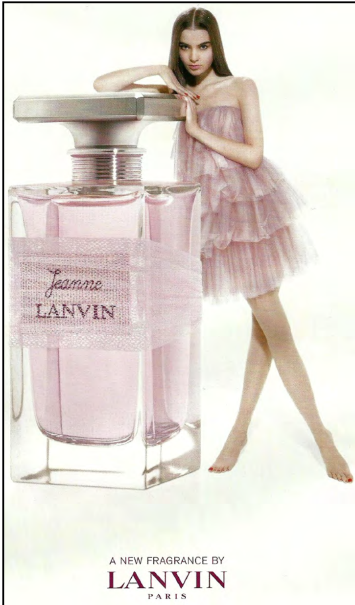
1. Jeanne Lanvin perfume advertisement