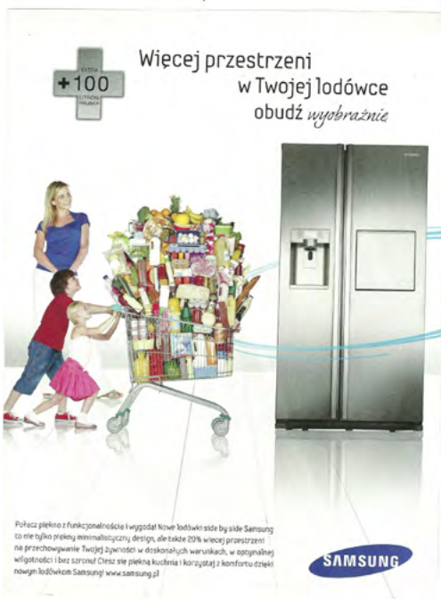
9. Samsung refrigerators advertisement