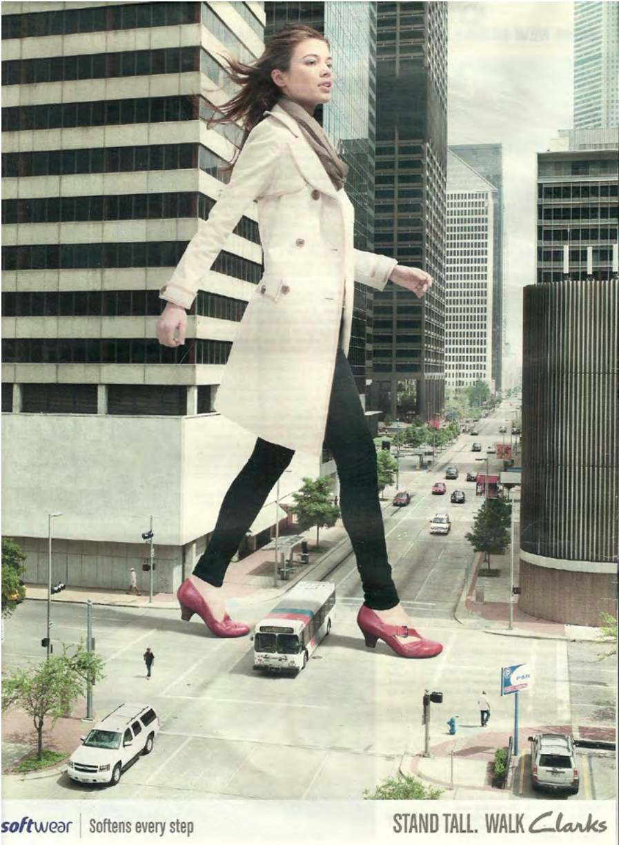
3. Clarks footwear advertisement