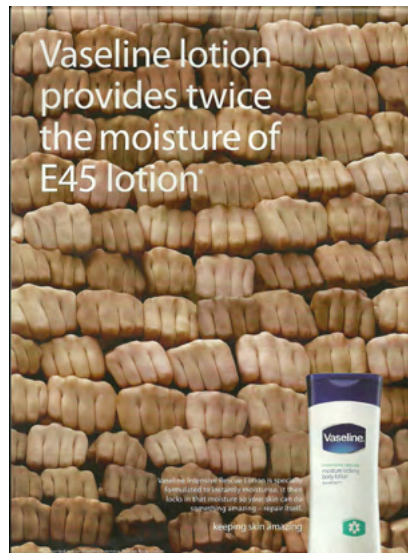
10. E 45 Lotion advertisement