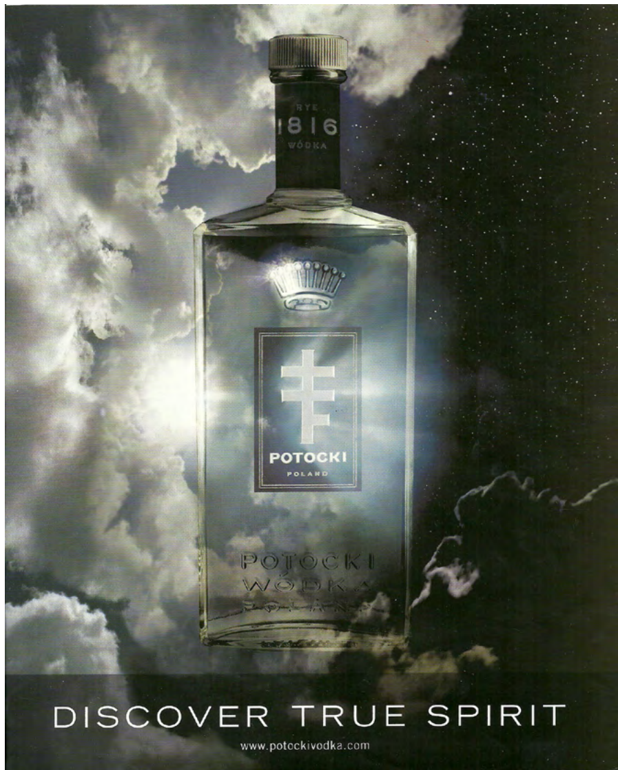
13. Potocki vodka advertisement