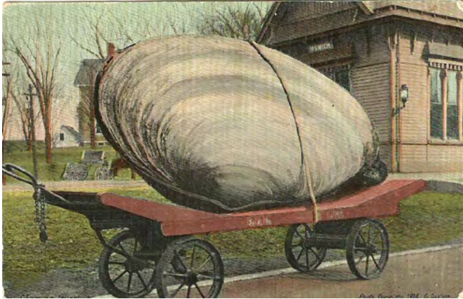
5. American postcard from the 1920s