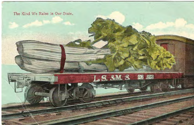
6. American postcard from the 1920s