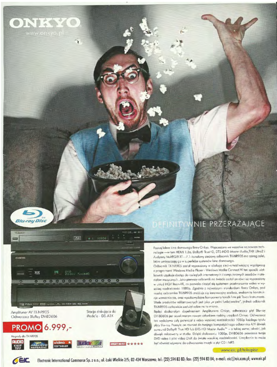
2. ONKYO player advertisement