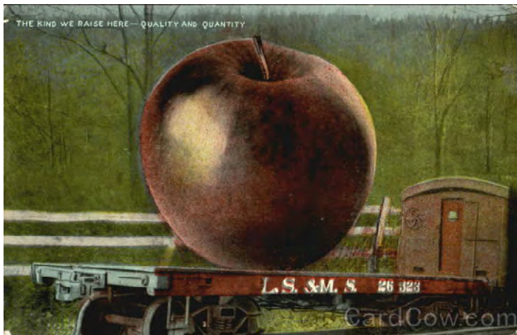
7. American postcard from the 1920s