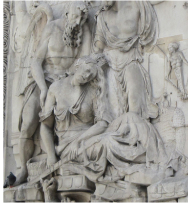
Fig. 8. The figure of a woman representing London

Various authors, commenting on the Monument's allegorical message, drew attention to particular details. Robert Seymour observes that Cibber's sculpture presents in stone what the South side inscription reveals in words, i.e. praise of Charles II, who 'commiserating the deplorable state of things, whilst [whilst] the ruins were yet smoaking [smoking], provided for the comfort of his citizens, and the ornament of his city' 33 . John Noorthouck notes that the beehive shows that 'by industry and application the greatest misfortunes may be overcome' 34 . An alternative (or additional) interpretation which could be offered, based on Christian symbolism, would read the beehive as denoting