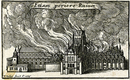
Fig. 1. Old St Paul's Cathedral burning in the Great Fire, etching by Wenceslaus Hollar, in possession of the British Museum

The Great Fire lasted until the 5 th of September. It devastated 87 of the existing 109 churches (including St. Paul's Cathedral), burned 52 livery company halls 19 , numerous civil administration buildings and courts, totally obliterating the city infrastructure and making around 100 000 people homeless (fig. 1). It levelled approximately 436 acres of space. In the words of a British historian: '[Fire] laid waste five sixths of the walled area of the medieval city, from Fleet Street in the west to the Tower of London in the east, and north from the bank of the Thames to the wall at Cripplegate. [...] Within the area of the fire no buildings survived intact