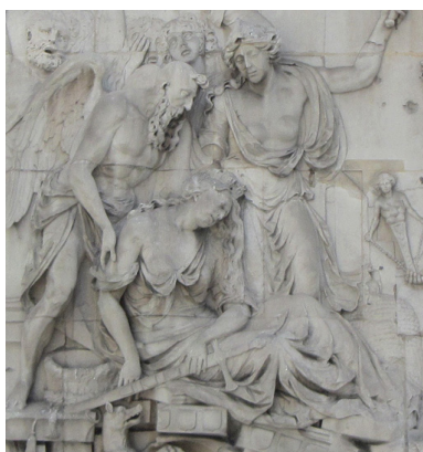
Fig. 11. The figure of Time (Kairos)

‘a pious and unified community’ 35 , which would highlight Londoners’ common purpose and shared belief. Christoph Heyl focuses on the figure of Time (fig. 11) stating: