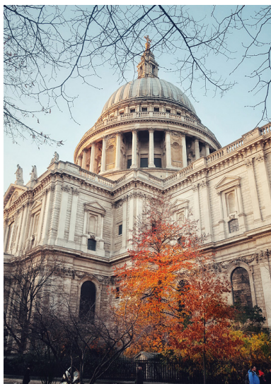
Fig. 14. St Paul's Cathedral designed by Sir Christopher Wren

an impression that selected events of the nation's history may act as bricks and mortar in social consciousness and cohesiveness, simultaneously providing an anchor in the fast changing world, leads to stability. In the collective memory of the British, the Great Fire of London plays the role of a great bonding mechanism. It links individual with societal, past with present, destruction with resurrection, history with myth, the physical with the spiritual, the perishable with the immortal, and the history of the capital city with the history of the country. As a memory site, the Fire is a bastion of London's myth of its invincibility and the nation's determination to preserve it.