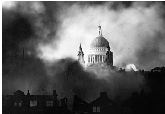
Fig. 15. St Paul’s Cathedral during the 1940 blitz

and the Cathedral was severely damaged, ‘the image of the dome with its cross held high above the tumultuous smoke and the glare of flame was seared into Londoners’ imagination: the image of survival’ 72 . The 1940 photograph of Wren’s magnificent dome towering over destruction became an iconic representation