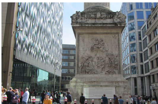
Fig. 7. Caius Gabriel Cibber's plinth

The North side carries information about the fire itself, how it started, how much damage it caused, and how it was eventually extinguished (fig. 6). The role of King Charles II in fighting the blaze is described on the South side, and the history of building the Monument on the East. The West side features an allegorical relief by Caius Gabriel Cibber, which is dense with detail and meaning (fig. 7).