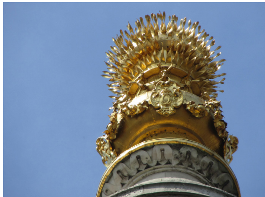
Fig. 5. The flaming orb of the Monument

The Monument commemorates the destruction of London and forecasts the city's restoration both in letters and in sculpture 32 . The plinth of the column is inscribed on three sides with text in Latin and its English translation.