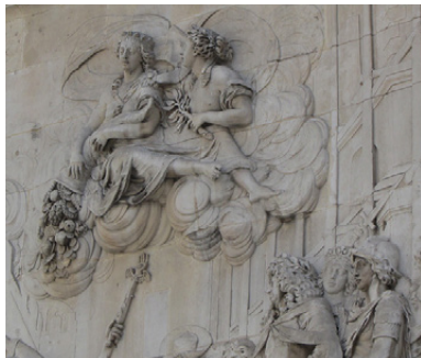
Fig. 10. Two goddesses with a cornucopia and a palm branch