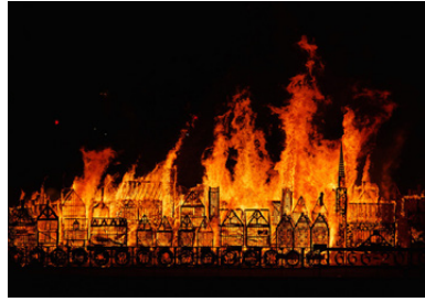
Fig. 13. London's Burning – 350 th anniversary of the Great Fire

the way for the building of the modern city' 45 , which 'devastated the capital and forced it into a rebirth' 46 , and which 'shaped the London we know now' 47 . Much attention was given to 'the London of today [...] built from the ashes of the wooden city' 48 , 'the capital's resilience [which] helped it rebuild and survive' 49 , 'the great city we enjoy today [which managed to] rise from those ashes, develop and thrive' 50 , 'the resilience of London and its people in rebuilding their City' 51 , and 'the city's ability to rebuild and thrive' 52 .