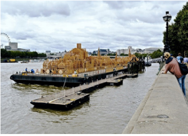
Fig. 12. Wooden replica of the seventeenth century London