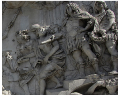
Fig. 9. King Charles II offering support