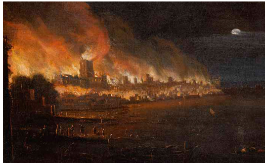
Fig. 2. An anonymous oil painting of the Great Fire, the view taken from the West