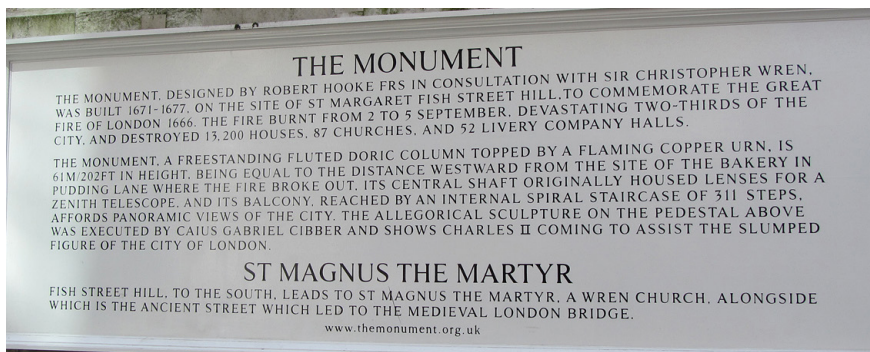
Fig. 6. Information on the Monument