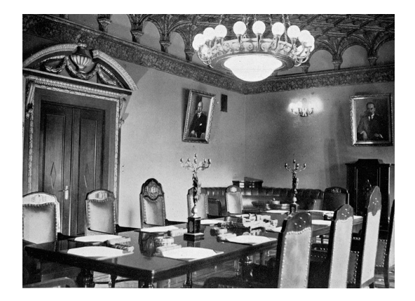
Fig. 8. The Conference Room in the Bank of Lithuania