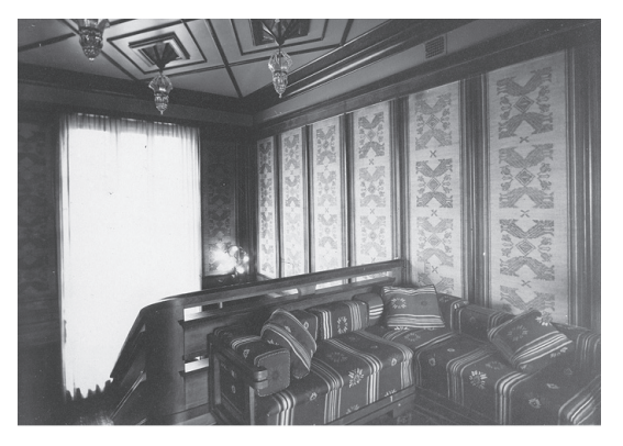
Fig. 6. Jonas Vailokaitis' living house interiors in Kaunas, arch. Arnas Funkas

Following the forms of folk art and crafts, the professional artists tried to replicate the typical primitive nature of folk arts, but freely reproduced and interpreted them. High-quality, single- or limited-edition elements of the National Style interior corresponded