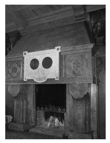
Fig. 3. The fireplace in the Lithuanian Military Officer's Club in Kaunas, Vytautas the Great Sitting room (Photo: L. Preišegalavičienė, 2016)