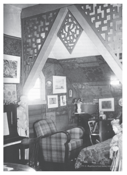
Fig. 10. G. Bagdonavičius home interior. Šiauliai Aušros Museum, F-FN 8318

This chapter aims to reveal different forms of the conception of the national, which existed during the interwar period in Lithuania. They were determined by the tradition, religion and