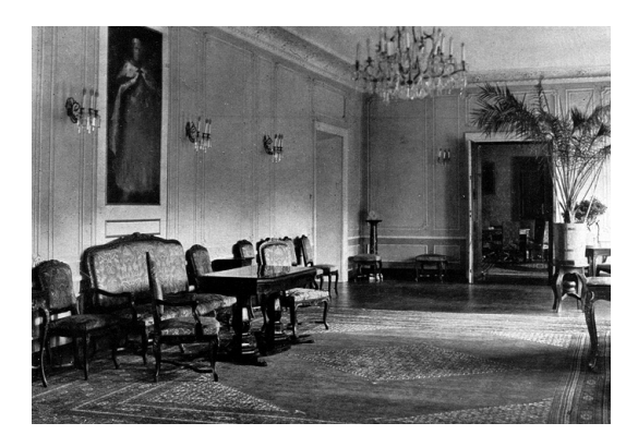
Fig. 7. President's Antanas Smetona's Reception hall