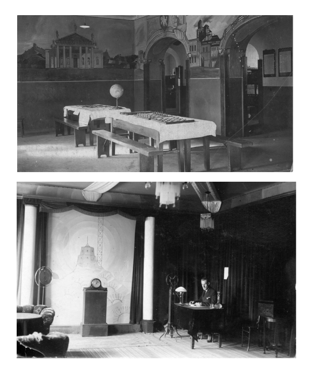
Fig. 4. Library room in Lithuanian Army's Duke Vytenis' 9<sup>th</sup> infantry's regiment, 1930–1940