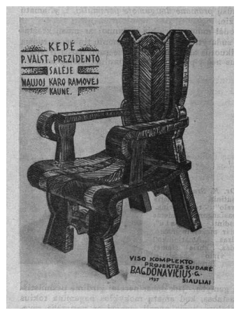
Fig. 2. Project of an armchair for the President's reception room by Gerardas Bagdonavičius