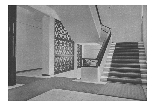
Fig. 9. Interior of Lithuanian Trade Industry and Crafts Chamber